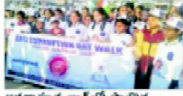
అవగాహన వాక్ లో పాల్గొన్న విద్యార్థులు, యువత